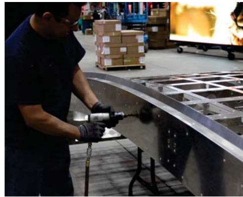
^ Single piece construction

Samsung displays are fully assembled, calibrated and tested at the factory, then shipped to their final location in large sections. This minimizes the number of parts in transit and simplifies installation. When the sections arrive on-site, they are put together and once they are installed, they are tested and calibrated again, quickly and efficiently. This ensures the color and image quality is maintained.